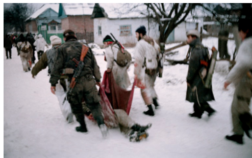
RUSSIA. Chechnya. Alkhan-Kala. 02/2000. Chechen fighters drag a fallen comrade when they leave Grozny after several month of fighting the Russians. Two groups of about 2000 fighters left Grozny through a mine field and several hundred were killed or lost their feet.