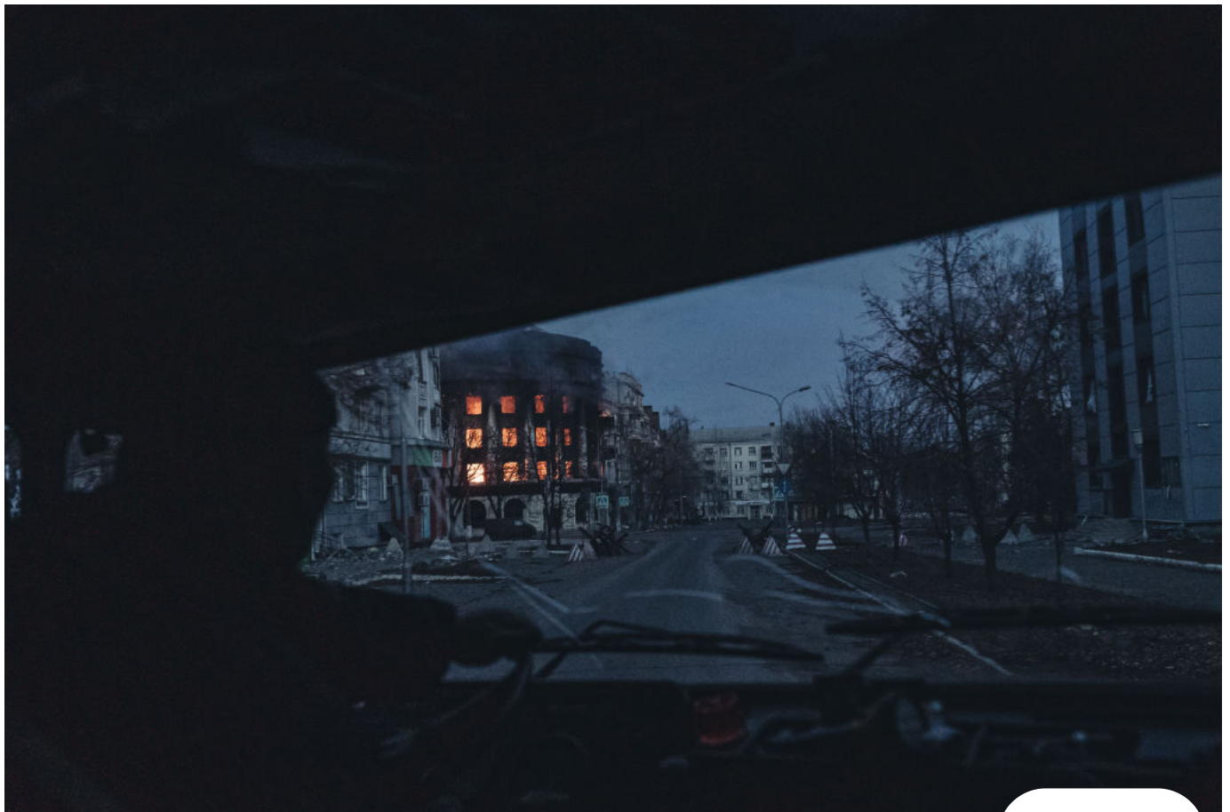
A view of a building destroyed by Russian shelling in the center of Bakhmut, Donetsk Oblast, on February 4, 2023