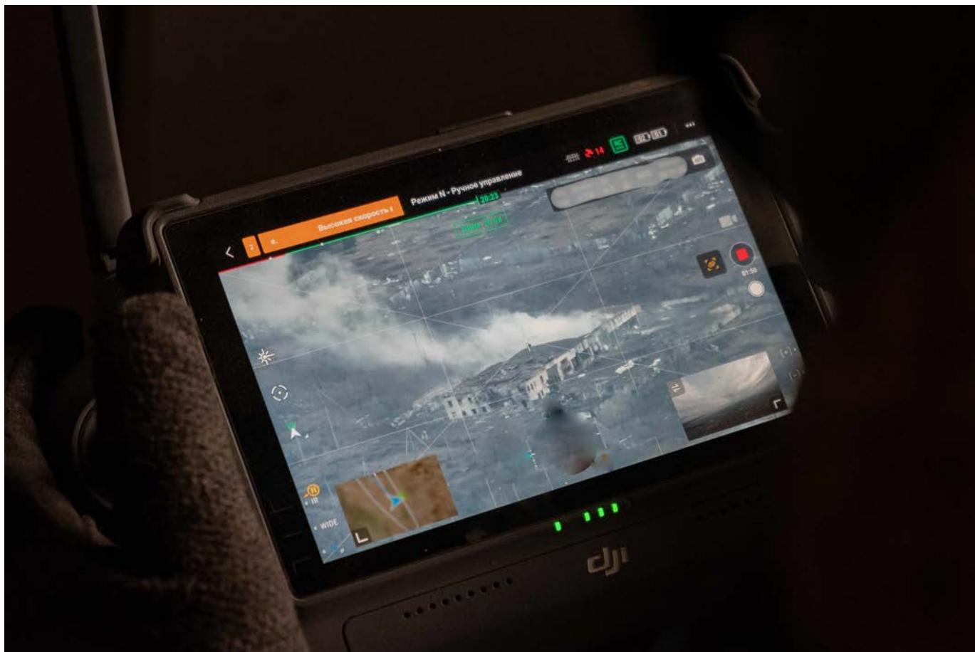
A cloud of smoke rises from a warehouse building after a strike by a Ukrainian 2S-7 Pion howitzer, as seen on the remote of a Skala Battalion drone in Bakhmut, Donetsk Oblast, on Dec. 29, 2022. Coordinates of the drone's position have been blurred out to protect the pilot's location.

In ideal conditions, with artillery at the ready, it can take as little as five minutes between the drone pilot spotting a target and Ukrainian artillery engaging it.