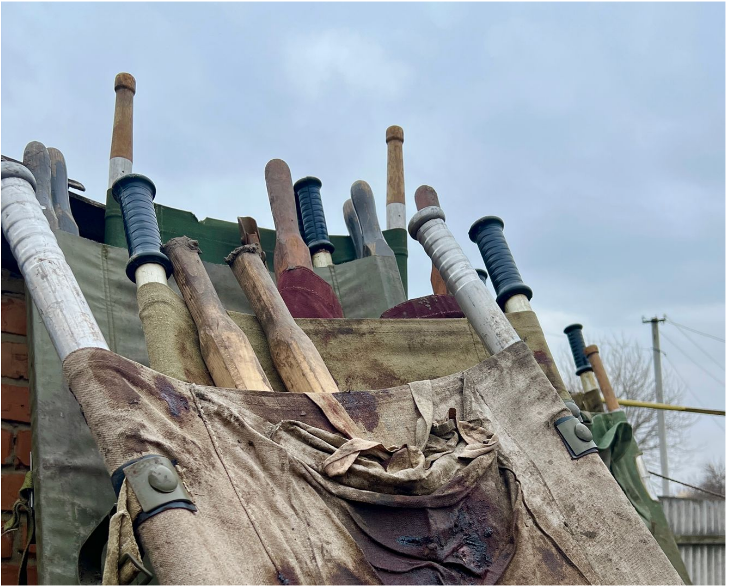
Stretchers stacked up against a wall at a medical stabilization point near the front line in Donetsk Oblast, on March 23, 2023

Small arms fire cracks in the background as another Ukrainian unit holds some light target practice into the hillside behind the house.