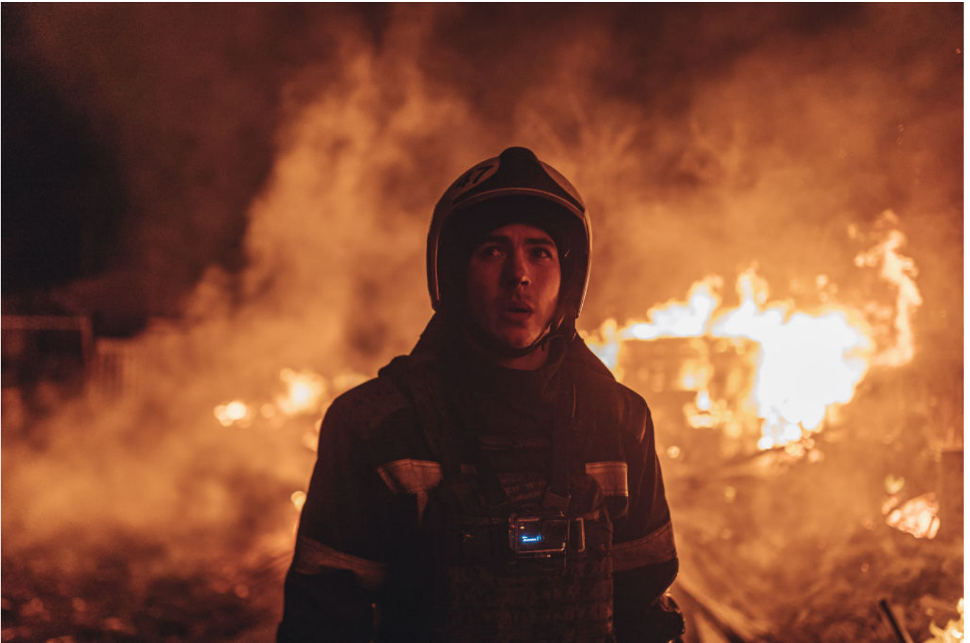
Ukrainian first responders extinguish a fire after shelling on the Bakhmut front line in Ivanivske, Donetsk Oblast, on Jan. 02, 2023.