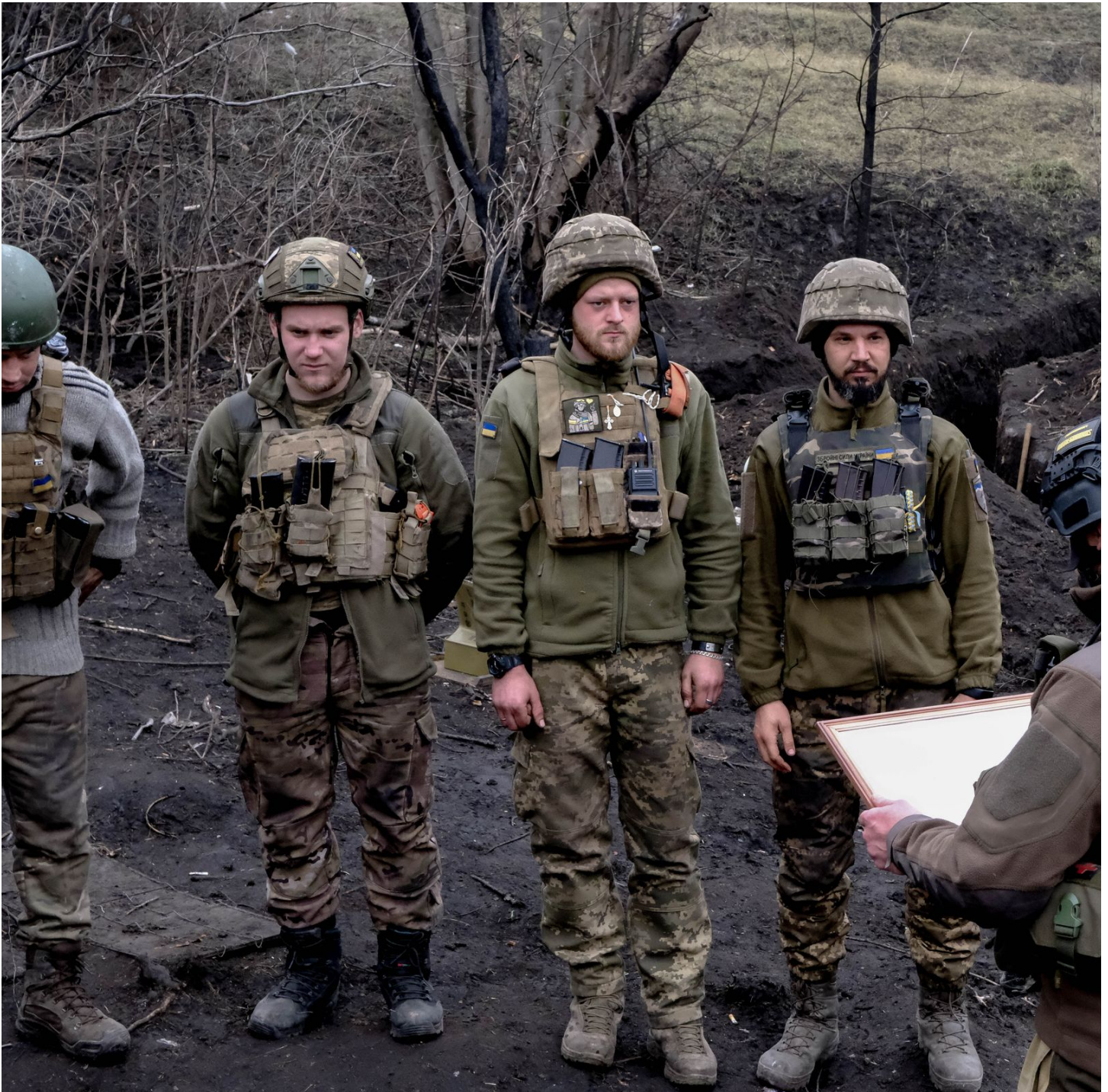
Ukrainian infantrymen of the 10th Mountain Assault Brigade stand to receive awards from local authorities on the front line in Donetsk Oblast, on March 23, 2023.