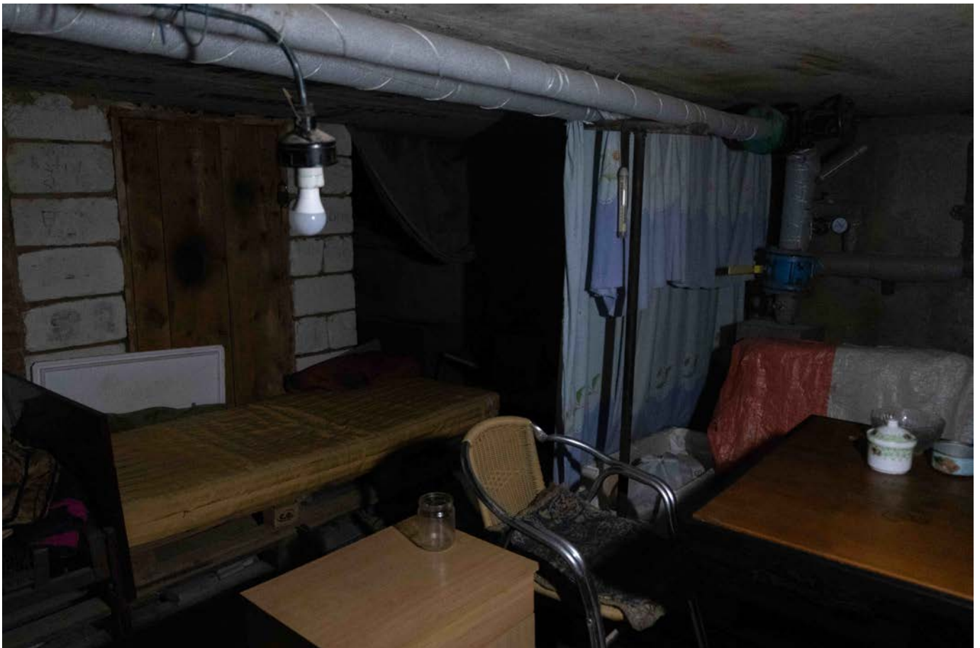
The interior of an unheated basement shelter in Bakhmut, Donetsk Oblast, on Jan. 2, 2023.