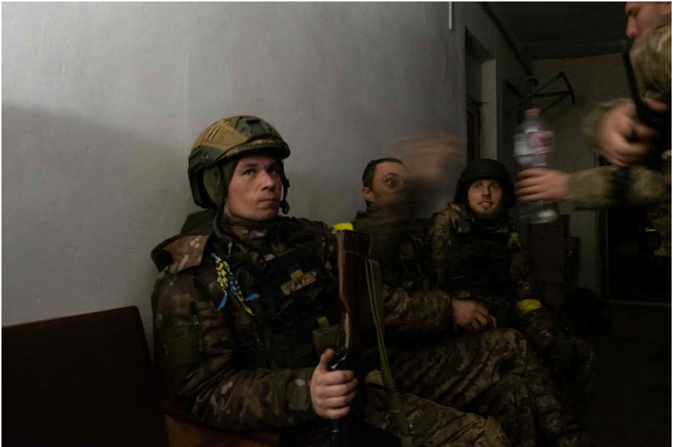
Assault troops of the Skala Battalion return to base after a mission in the outskirts of Bakhmut, Donetsk Oblast, on Dec. 29, 2022.