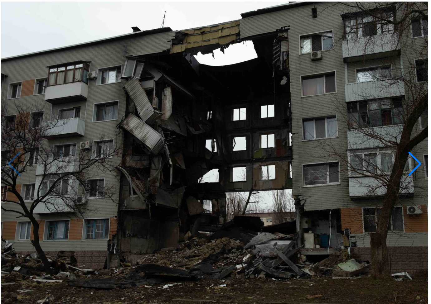
An apartment building destroyed by a Russian missile in Bakhmut, Donetsk Oblast, on Jan. 2, 2023.