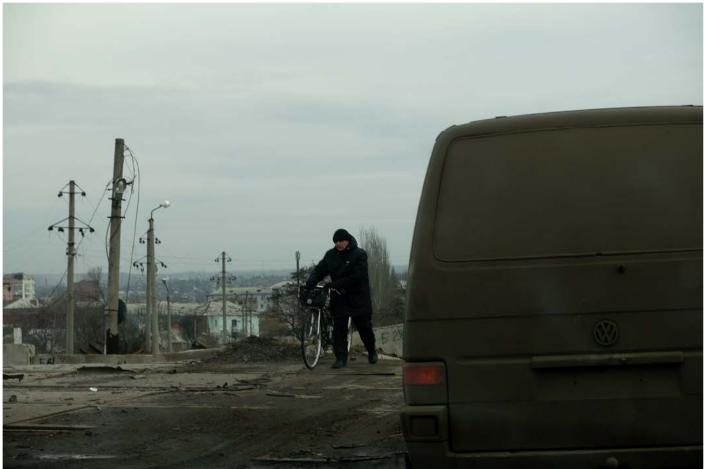
A resident pushes his bicycle across ruined train tracks in Bakhmut, Donetsk Oblast, on Jan. 2, 2023.

On Jan. 25, their families confirmed that both men had been killed, though the exact circumstances of their deaths remain unknown.