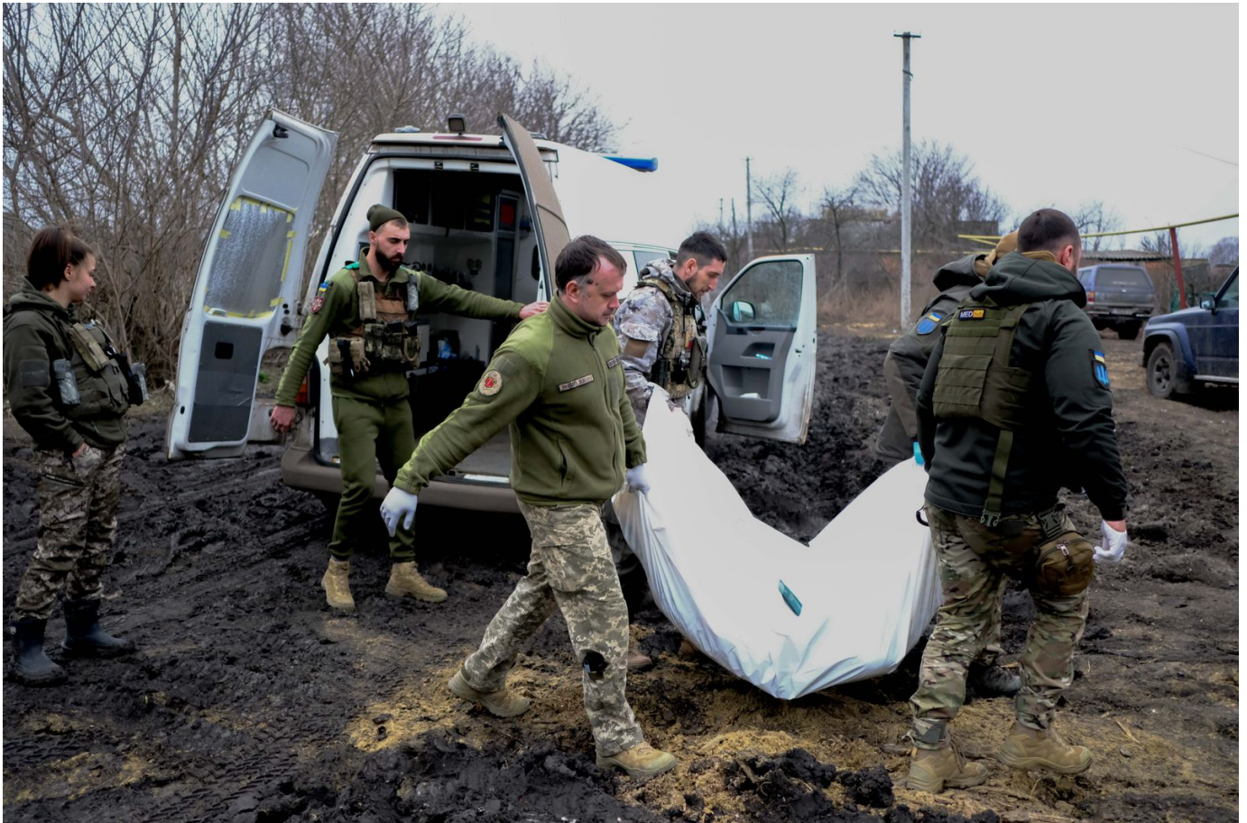
Ukrainian medics retrieve the body of a fallen soldier from a van near the front line in Donetsk Oblast, on March 23, 2023.

The team moves the bag, with the soldier’s military ID taped prominently on the outside, from one car to another, and sends it on its way.