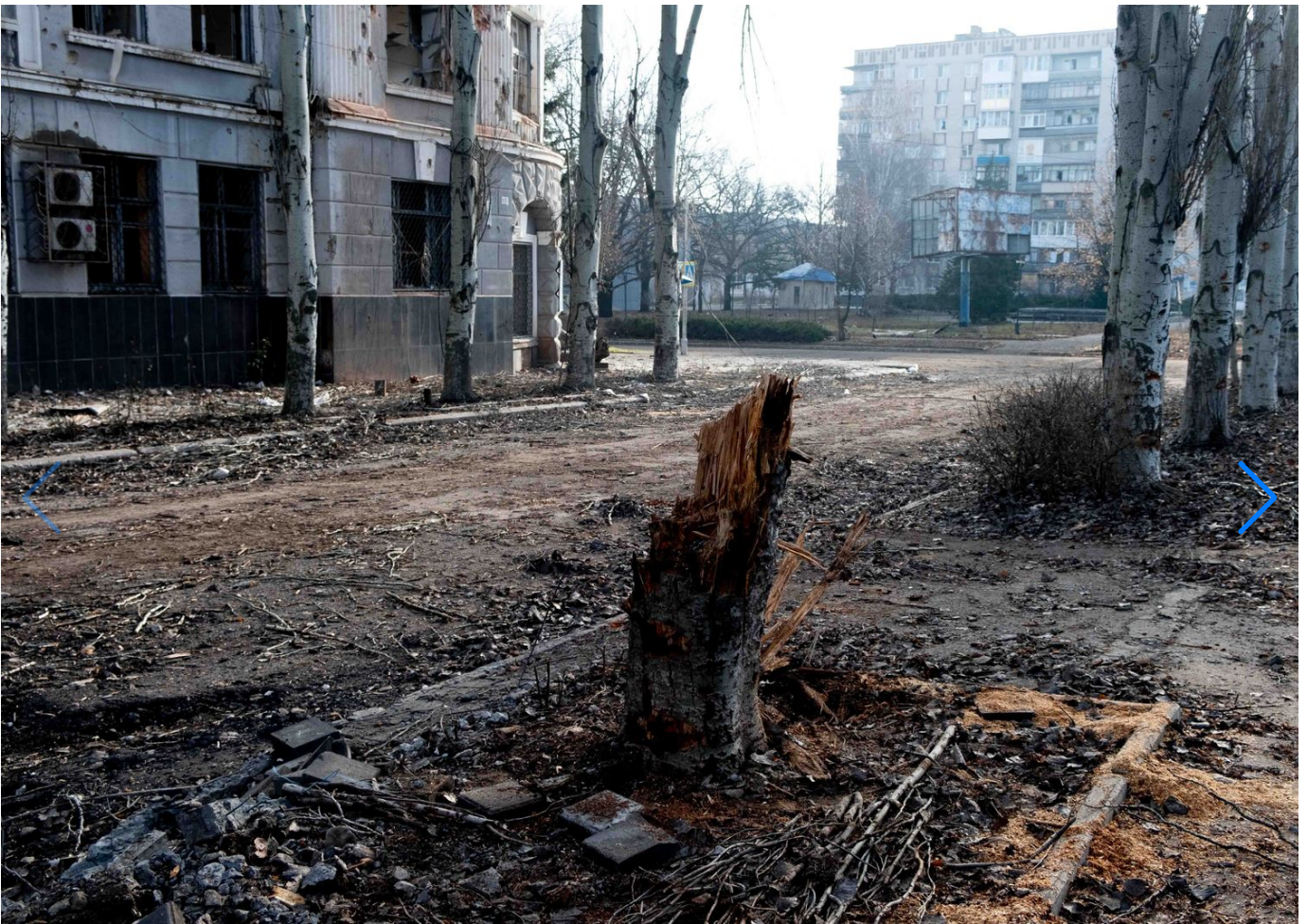
A tree destroyed by shelling on the central square of Bakhmut, Donetsk Oblast, on Jan. 3, 2023.