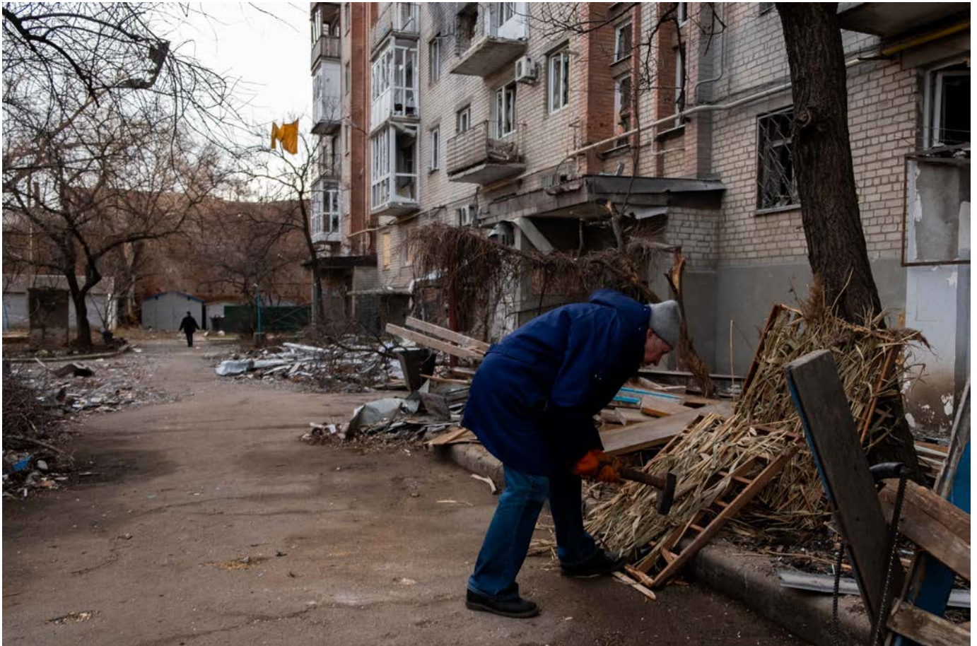
A resident of Bakhmut, Donetsk Oblast, cuts firewood for heating, on Jan. 2, 2023.

A group of half a dozen residents, mostly of pension age, were milling around the entrance: some chopping firewood, some cooking on makeshift brick stoves, and some just standing in silence.